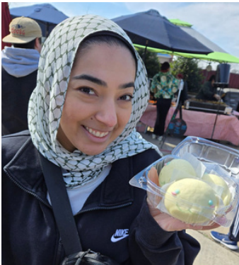
Me trying these cute custard buns shaped like sheep at the Dallas Thai Market this year!